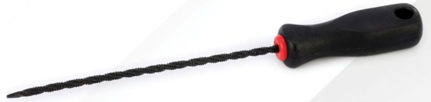
SM-68 Cleaning Bar