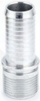
SM-82 Hose Record - Gear