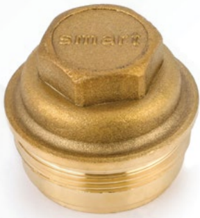
SM-56 Regulator Cover