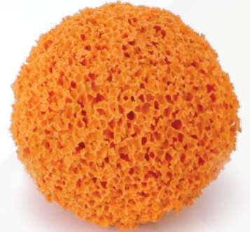
SM-52 Cleaning Ball