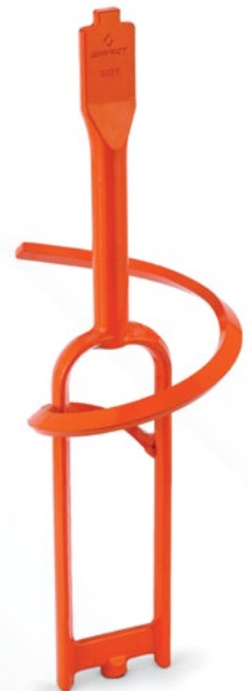
SM-81 Mixing Shaft