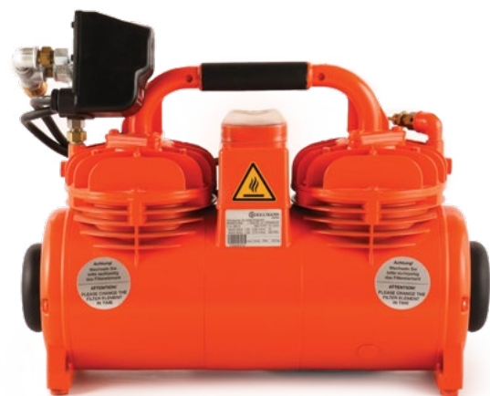
SM-43 Air Compressor