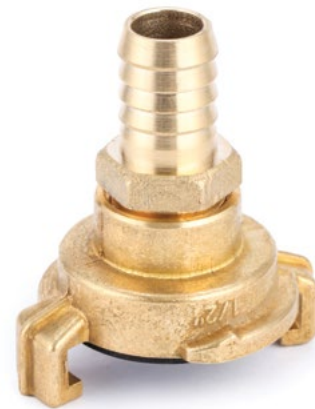
SM-88 Coupling - Water / 18 mm