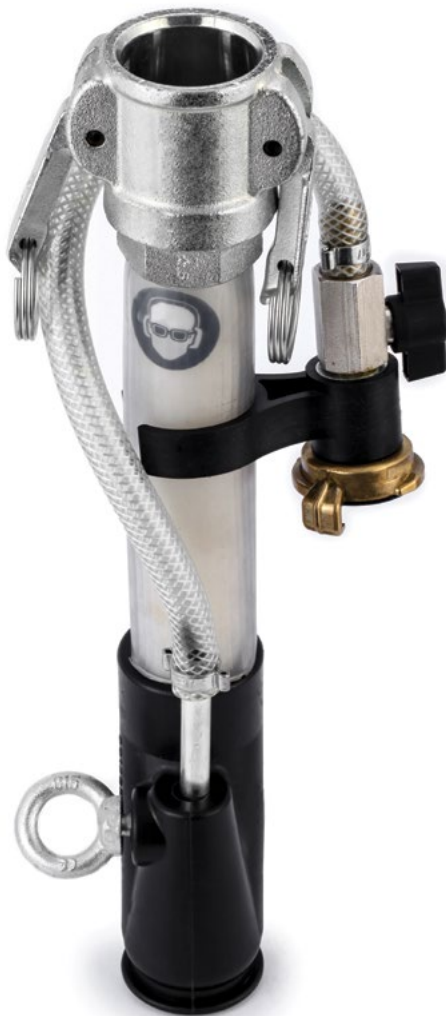
SM-65 Spray Gun - Short