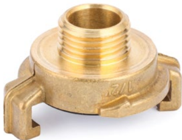
SM-86 Coupling 1/2