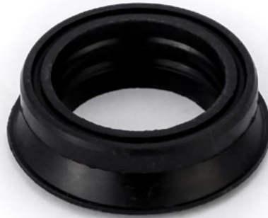
SM-51 Gasket 22 mm