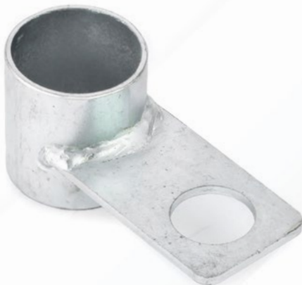
SM-70 Gun Buckle