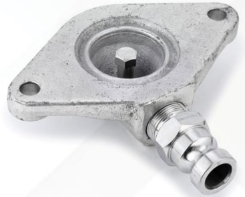
SM-64 Lower Flange