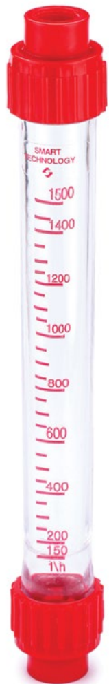
SM-53 Flow Meter