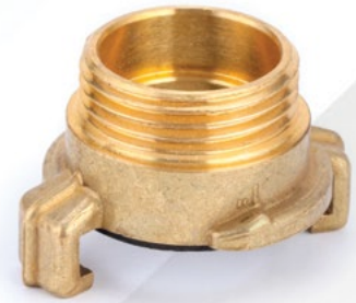
SM-84 Coupling 1/1