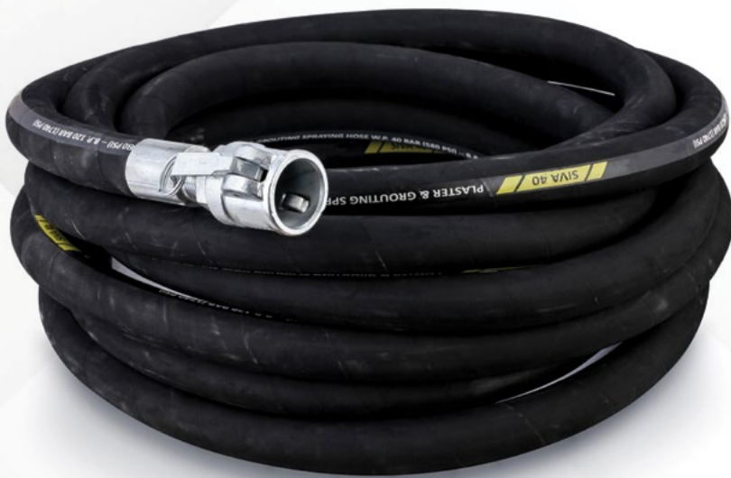
SM-80 Hose - 25 mm / 15 mt