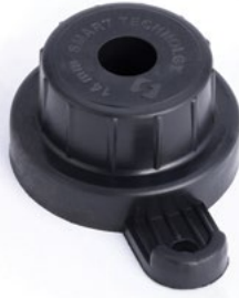
SM-63 Spray Head 14 mm