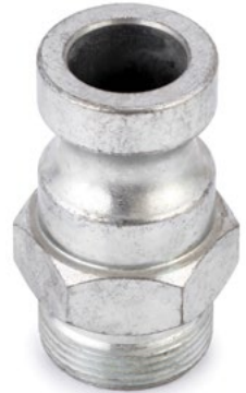
SM-79 Lower Glange Record