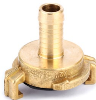
SM-89 Coupling - Air / 12 mm