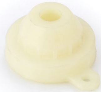
SM-54 Spray Head 14 mm