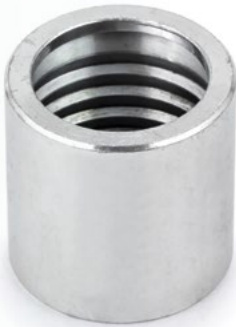
SM-77 Hose Ring