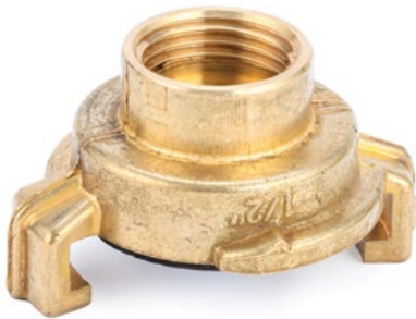
SM-85 Coupling 1/2