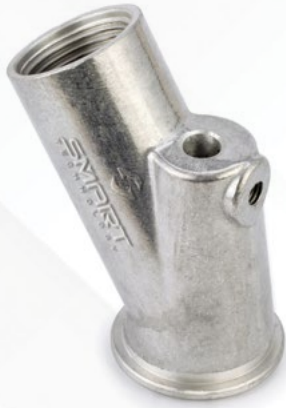
SM-67 Curved Head - Angled