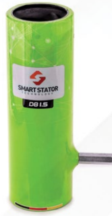
SM-23 Smart D8-1.5