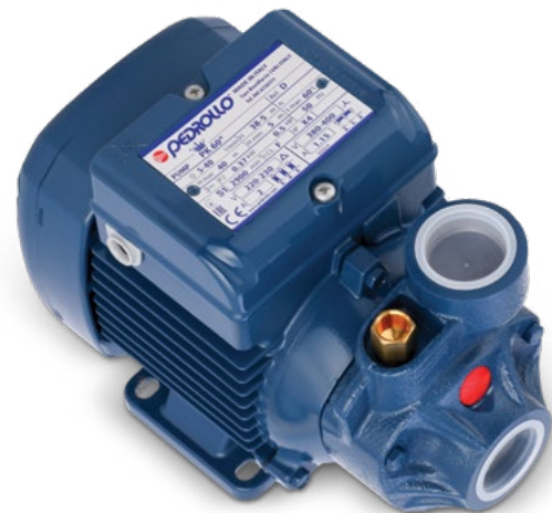
SM-42 Water Engine