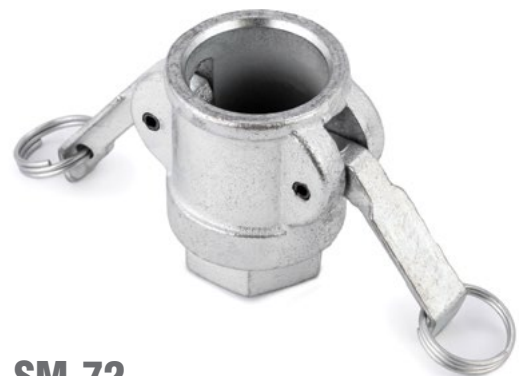
SM-72 Latch Coupling - 25 mm