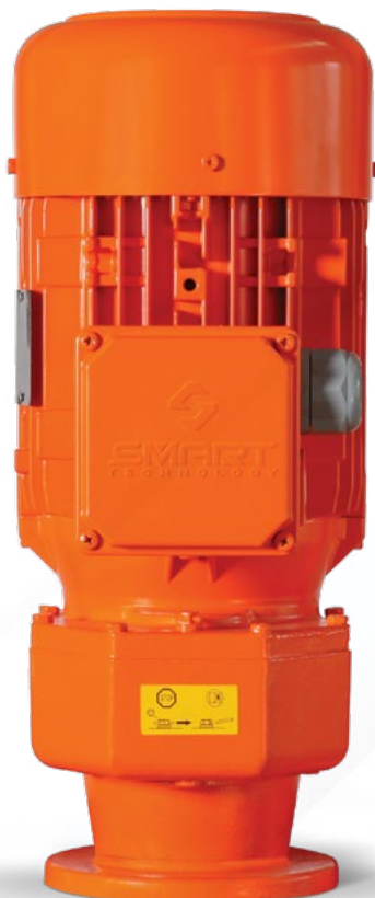
SM-41 Mixer Engine