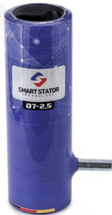
SM-25 Smart D7-2.5