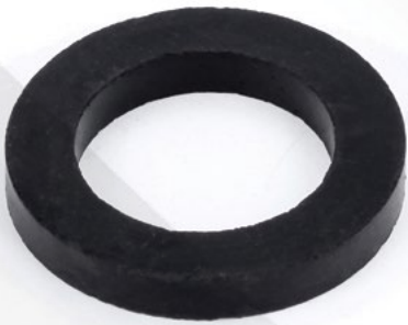
SM-50 Gasket 25 mm