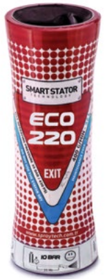
SM-27 Smart Eco-220