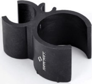
SM-73 Gun Buckle