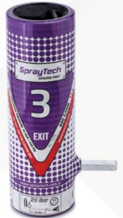
SM-24 SprayTech D8-2