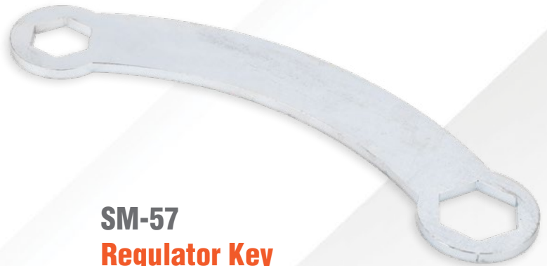
SM-57 Regulator Key