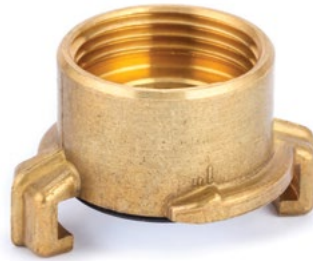
SM-83 Coupling 1/1