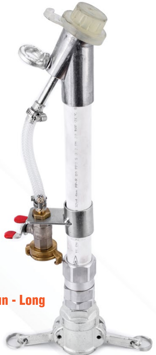
SM-66 Spray Gun - Long