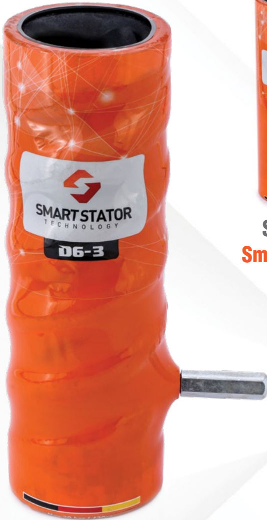
SM-21 Smart D6-3 Twister