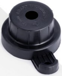
SM-62 Spray Head 12 mm