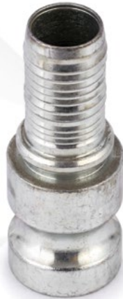
SM-78 Hose Record