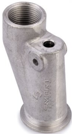
SM-69 Curved Head - Straight