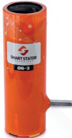
SM-22 Smart D6-3