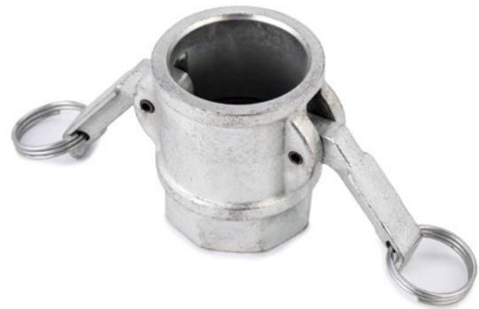
SM-71 Latch Coupling - 35 mm