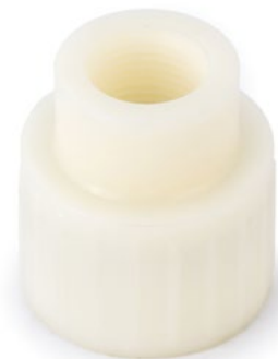
SM-55 Flow Meter Record