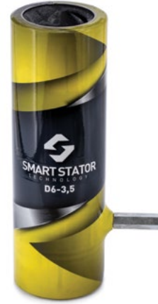
SM-26 Smart D6-3.5