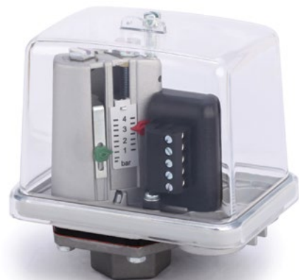
SM-61 Pressure Switch